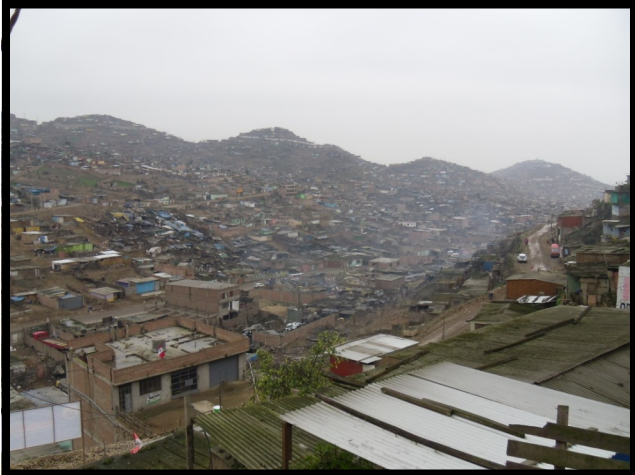
Pamplona is an area on the outskirts of Lima that began when squatters claimed sections of land. Now it is a recognized area of the city.