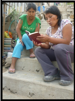
Pray that the ladies will meet together on their own to study the Bible rather than waiting