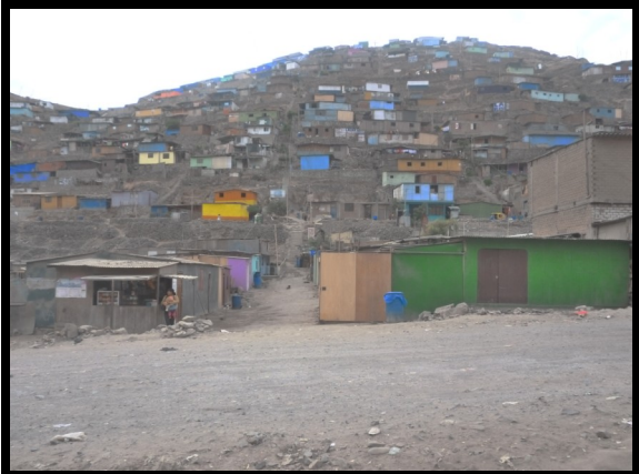
From the main road looking up.